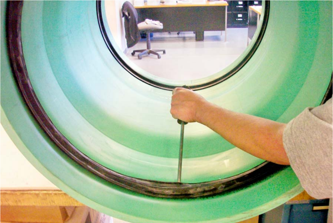
ILLUSTRATION # 1